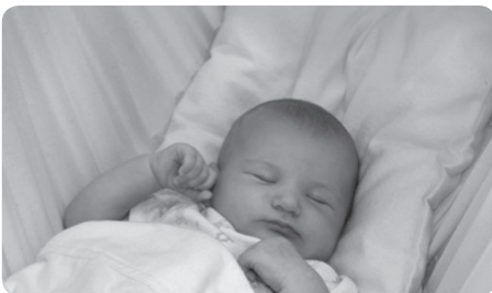
With a Mattress Stiffener

If baby begins to roll, sit or pull up in the hammock it is no longer suitable.