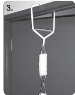
3. Attach hammock spring with the quick-link clip.