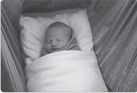
Olive Green Organics Hammock. Baby can be swaddled and tucked in with a sheet or blanket.

Available from www.naturesway.co.nz & our stockists