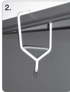
2. Hook over framing and pull down to check it is secure.