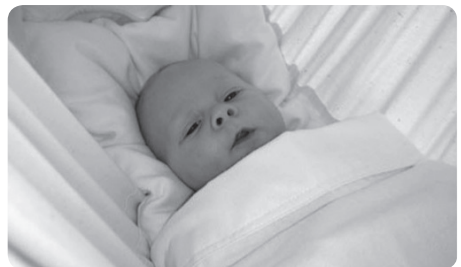
Without a Mattress Stiffener