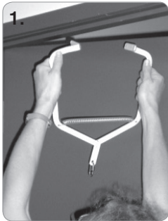
1. Open door clamp.

For a great mobile or temporary option, the Natures Sway Door Clamp is sometimes the best solution as when traveling it will often fit on the frame of an open wardrobe. If visiting a friend you can take baby's familiar bed for their routine sleep without needing to transport the stand. The powder-coated door clamp is designed to clamp onto the framing of most standard doorways up to 250mm wide and is sprung loaded to grip tighter the more weight you apply. It has clear non-toxic PVC tubing on the top clamps to protect paintwork and provide a non-slip hold, and a stainless steel quick-link for secure and easy hammock attachment.