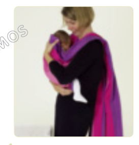
6 ... lift your baby up in the sling and settle him against your chest while leaning back slightly.