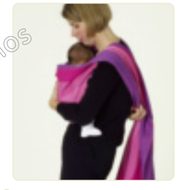
8 ... then cross the tails behind your back. ...