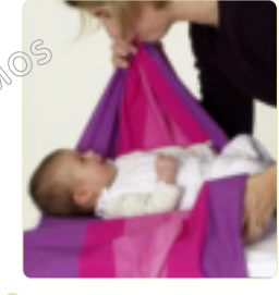
3 ... put your free hand under the other sling tail and pull the bottom rail up to the back of your baby's knees.