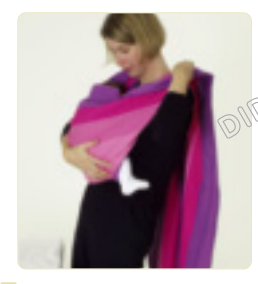
Pull on the top rail on each side of your baby's head to tighten it - one hand always holding your baby securely! –