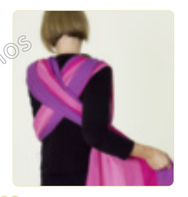
Tighten each of the tails with one hand (the other holding baby) by pulling on the rails ...