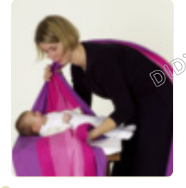
While leaning forward, put one sling tail over your shoulder; at the same time ...