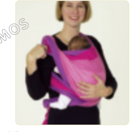
13 Cross the fabric over both shoulders by flipping the rail closest to your neck under the outer rail and down over your upper arm.