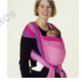
15 If your sling is not long enough to tie at your back, you can tie the tails under your baby's bottom.