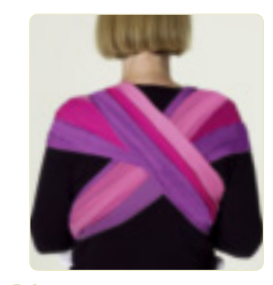
16 The fabric on your back should be spread out flat.