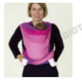
12 ... and around to your back again where you tie them.