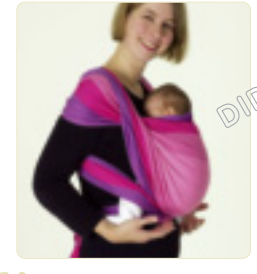
Finally, push your baby's legs up a bit to make sure he is sitting in the correct frog-leg position, his back rounded and securely held in the DIDYMOS sling.