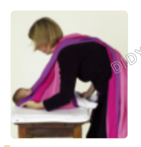
5 Hold your baby's head with one hand and, with the other hand supporting his back, ...